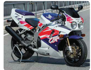
The CBR900RR Fireblade that started all.

More than 25 years after, the most powerful and nimble Honda bikes keep carrying the Blade legacy.